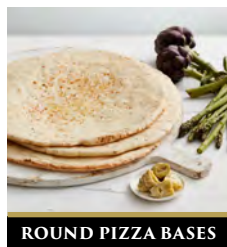
ROUND PIZZA BASES